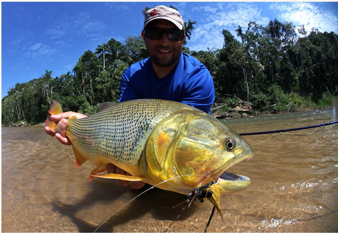
Pluma Lodge: Saturday, August 25 to September 1st.